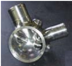
Precision machining of High Temp Alloys